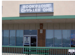
Chapter One Bookstore at Fair Hills Mall closed in 2005

headquarters because of a dispute over procedure. Several convenience store workers, some who had been there for more than a decade, were all fired and replaced by new hires who had been secretly interviewed, because the original workers were too well compensated. Most nationally famous companies that involve services such as technical support, insurance claims, and even medical diagnoses have out-sourced these services to India and beyond.