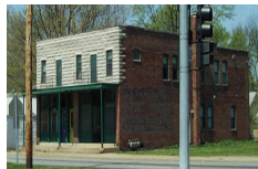
Pill Box Pharmacy on Lawrence closed in the 1980's and still stands empty today.

Long before now you've probably said to yourself " I'm not going to have time for this and I don't have the budget to support such an effort. " The more local forces we can gather,